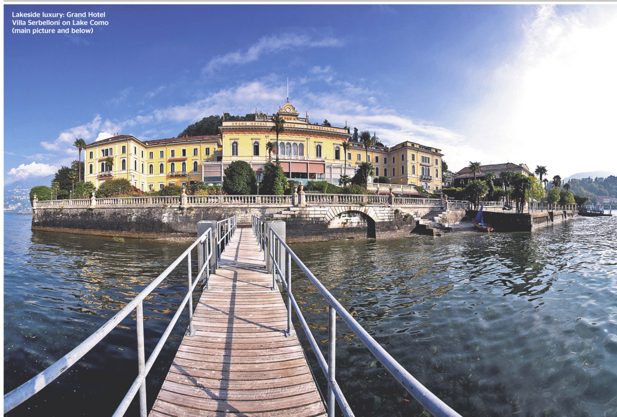
Lakeside luxury: Grand Hotel Villa Serbelloni on Lake Como (main picture and below)

'Cutting-edge fashion, designer hotels and cool Viking longships' A weekend in Copenhagen